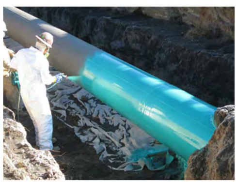
Pipeline Coating and Reconditioning Trained and certified personnel to meet all DOT -OPS Operator Qualification requirements to perform sandblasting and coating on pipelines and associated facilities. All work performed in with NACE and SSPC

All types of coatings and linings: polyureas, epoxies, phenolics, urethanes, coal tars, vinyl esters, etc. Force cure units up to 1 million BTU: ventilation units, diesel and electric, up to 75,000 CFM; state of the art dust suppression systems.